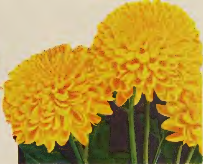
EARLY GOLD. 50c each; 3 for $1.25